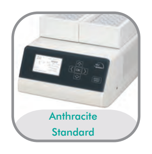
Further colours upon request:

The technically up-to-date, stylish and high quality touch panel significantly enhances handling and cleaning of the devices and sets new standards for the design of laboratory devices.