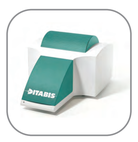
Microarray Scanner MArS for all Biochip applications

The easy to use fluorescence scanner saves lab time by running up to 4 slides in one scan job . The one-mouse-click operation for routine applications is based on predefined scan protocols including data analysis algorithms; optionally triggered by barcode reading .