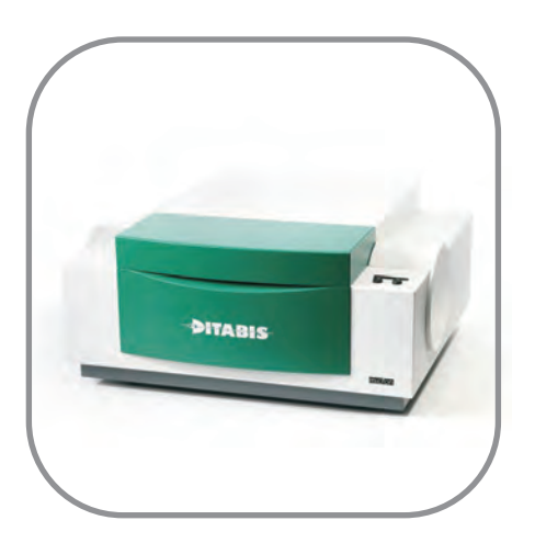
Imaging Plate Scanner Micron for TEM applications

To learn more about this affordable and reliable scanner system visit www.ditabis.com.